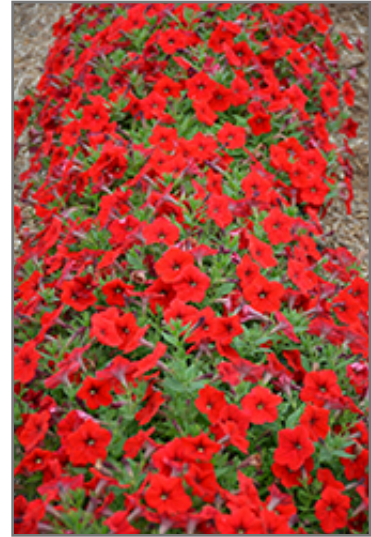
Easy Wave Red Petunia in bloom

Easy Wave Red Petunia is a fine choice for the garden, but it is also a good selection for planting in outdoor containers and hanging baskets. Because of its trailing habit of growth, it is ideally suited for use as a 'spiller' in the 'spiller-thriller-filler' container combination; plant it near the edges where it can spill gracefully over the pot. Note that when growing plants in outdoor containers and baskets, they may require more frequent waterings than they would in the yard or garden.