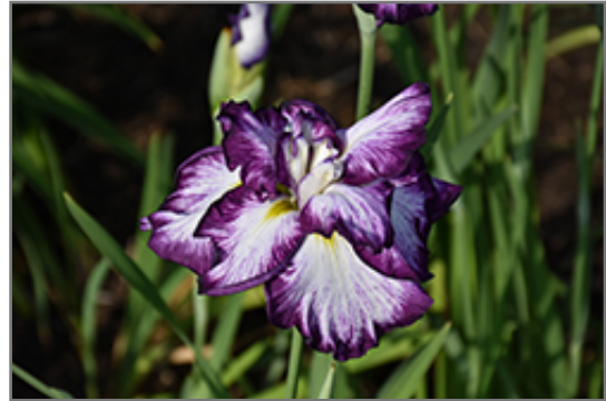
Lion King Japanese Flag Iris flowers

This plant will require occasional maintenance and upkeep, and should be cut back in late fall in preparation for winter. Deer don't particularly care for this plant and will usually leave it alone in favor of tastier treats. Gardeners should be aware of the following characteristic(s) that may warrant special consideration;