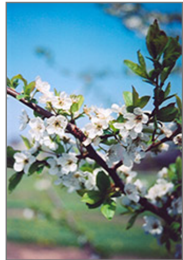
Shiro Plum flowers