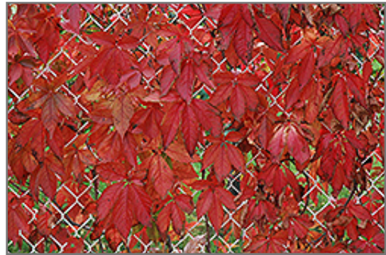
Englemann Ivy in fall