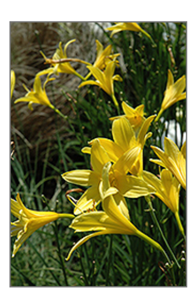
Lemon Daylily flowers

A lovely early bloomer with bright lemon-yellow flowers with a strong citrus fragrance; will slowly spread to form a colony and the flowers offer great contrast to the massed dark green foliage; diploid