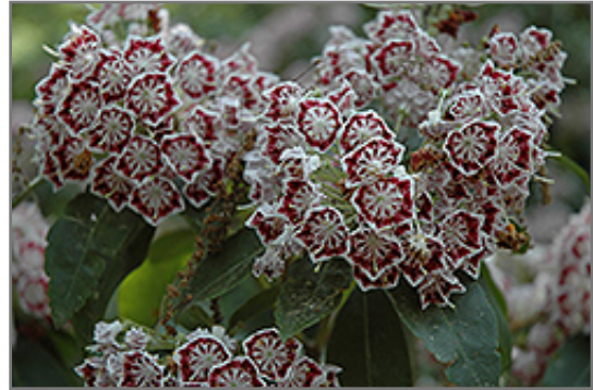
Bullseye Mountain Laurel flowers

This is a stunning spring blooming broadleaf evergreen shrub with amazing frilled white flowers with a purple band and bronze emergent foliage; must have superbly drained highly acidic and organic soil with a heavy mulch