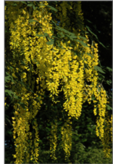
Weeping Laburnum flowers