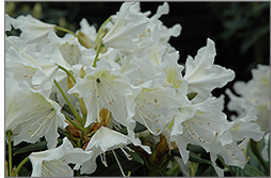
Cunningham White Rhododendron flowers

A stunning variety with large white blooms with greenish-yellow blotch that cover the branches in mid spring; eye catching as a garden accent; absolutely must have well-drained, highly acidic and organic soil, use plenty of peat moss when planting