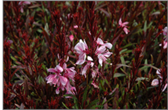
Passionate Blush Gaura flowers