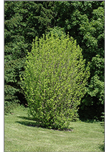
Golden Glory Cornelian Cherry Dogwood

Golden Glory Cornelian Cherry Dogwood is recommended for the following landscape applications;