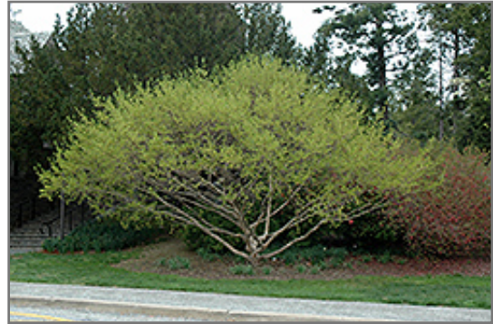
Golden Glory Cornelian Cherry Dogwood in bloom

This tree does best in full sun to partial shade. It is very adaptable to both dry and moist locations, and should do just fine under average home landscape conditions. It is not particular as to soil type or pH. It is somewhat tolerant of urban pollution. Consider applying a thick mulch around the root zone in winter to protect it in exposed locations or colder microclimates. This is a selected variety of a species not originally from North America.