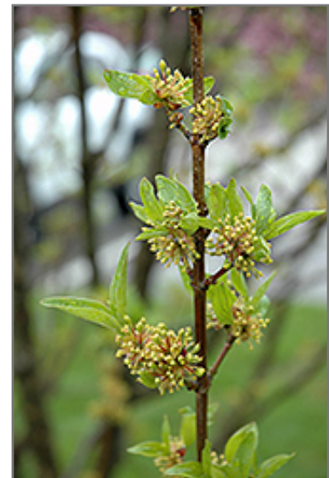
Golden Glory Cornelian Cherry Dogwood flowers