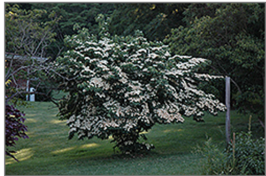
Milky Way Chinese Dogwood in bloom