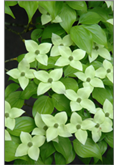
Milky Way Chinese Dogwood flowers

This is a relatively low maintenance tree, and should only be pruned after flowering to avoid removing any of the current season's flowers. It is a good choice for attracting birds to your yard. It has no significant negative characteristics.