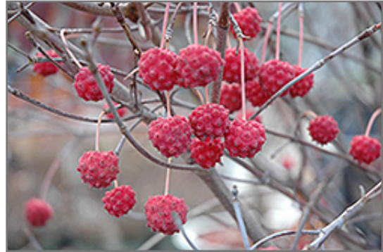
Milky Way Chinese Dogwood fruit

This tree does best in full sun to partial shade. It does best in average to evenly moist conditions, but will not tolerate standing water. It is very fussy about its soil conditions and must have rich, acidic soils to ensure success, and is subject to chlorosis (yellowing) of the foliage in alkaline soils. It is somewhat tolerant of urban pollution, and will benefit from being planted in a relatively sheltered location. Consider applying a thick mulch around the root zone in winter to protect it in exposed locations or colder microclimates. This is a selected variety of a species not originally from North America.