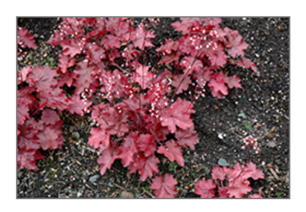
Fire Chief Coral Bells