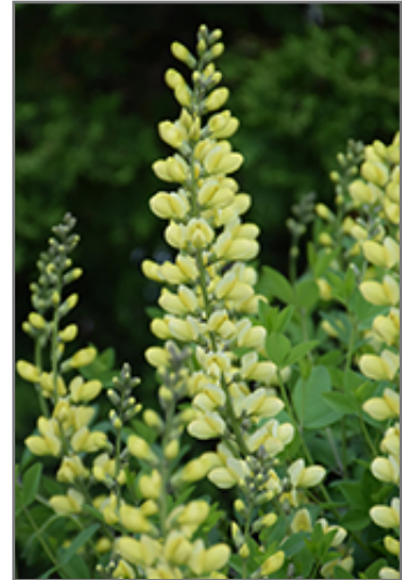
Carolina Moonlight False Indigo flowers

Carolina Moonlight False Indigo is recommended for the following landscape applications;