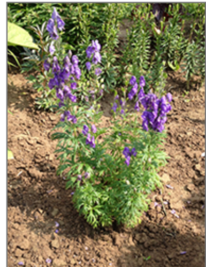
Azure Monkshood in bloom