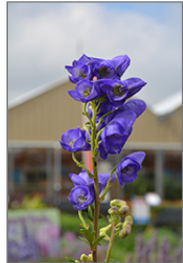
Azure Monkshood flowers