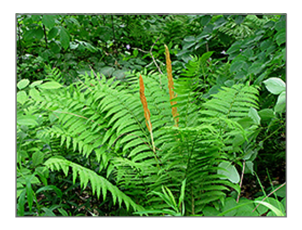
Cinnamon Fern in bloom

Cinnamon Fern is recommended for the following landscape applications;