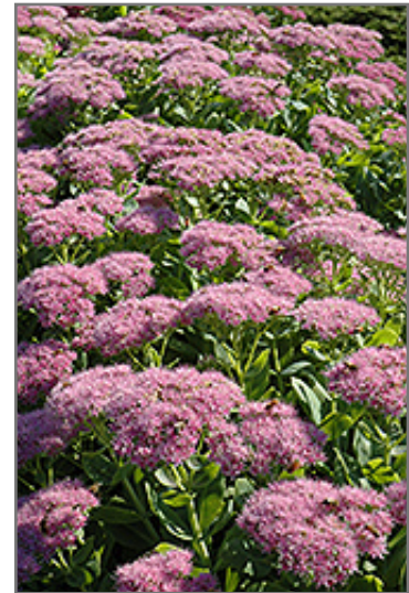
Brilliant Stonecrop flowers

Brilliant Stonecrop is recommended for the following landscape applications;