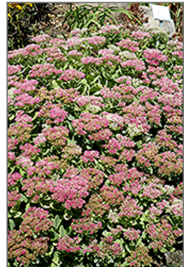
Brilliant Stonecrop in bloom