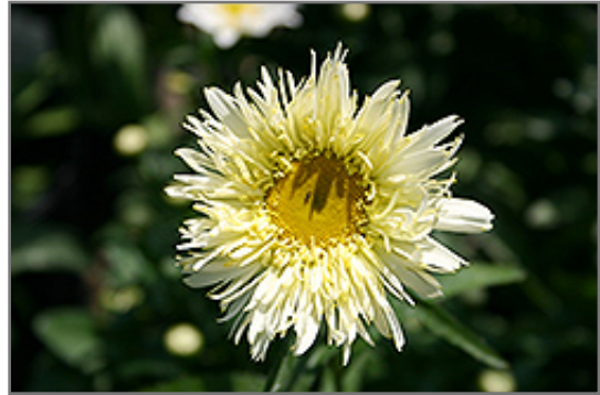
Gold Rush Shasta Daisy flowers