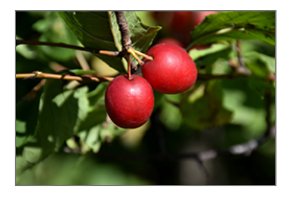
American Plum fruit

American Plum is clothed in stunning clusters of fragrant white flowers along the branches in early spring before the leaves. It has green deciduous foliage. The pointy leaves turn an outstanding yellow in the fall. The fruits are showy gold drupes with a ruby-red blush, which are displayed in mid summer. The fruit can be messy if allowed to drop on the lawn or walkways, and may require occasional clean-up. The smooth brown bark adds an interesting dimension to the landscape.