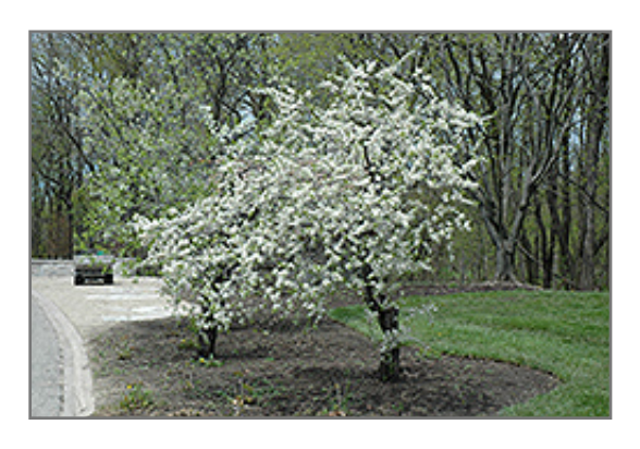
American Plum in bloom