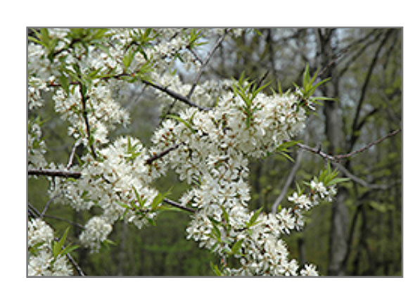
American Plum flowers

This tree is typically grown in a designated area of the yard because of its mature size and spread. It should only be grown in full sunlight. It does best in average to evenly moist conditions, but will not tolerate standing water. It is not particular as to soil type or pH. It is somewhat tolerant of urban pollution. This species is native to parts of North America.