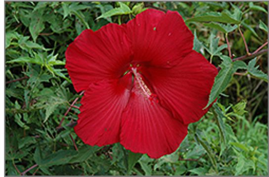
Lord Baltimore Hibiscus flowers

Other Names: Rose Mallow, Hardy Hibiscus