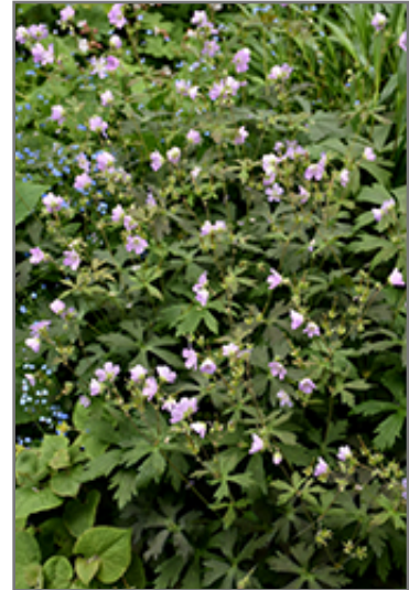
Espresso Cranesbill in bloom

Espresso Cranesbill will grow to be about 18 inches tall at maturity, with a spread of 24 inches. When grown in masses or used as a bedding plant, individual plants should be spaced approximately 20 inches apart. Its foliage tends to remain dense right to the ground, not requiring facer plants in front. It grows at a medium rate, and under ideal conditions can be expected to live for approximately 10 years. As an herbaceous perennial, this plant will usually die back to the crown each winter, and will regrow from the base each spring. Be careful not to disturb the crown in late winter when it may not be readily seen!