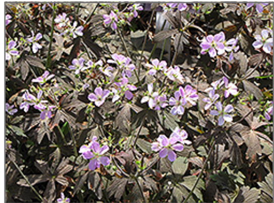
Espresso Cranesbill flowers