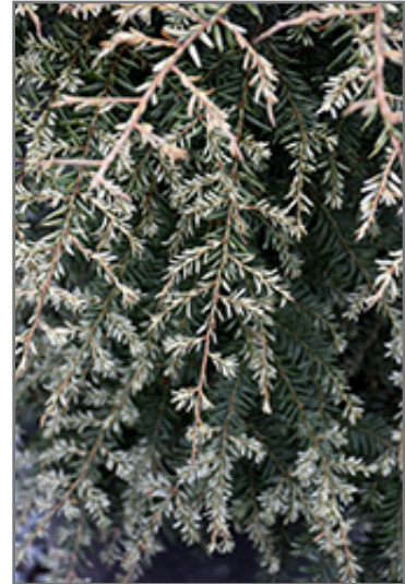
Gentsch White Hemlock foliage

Gentsch White Hemlock is recommended for the following landscape applications;