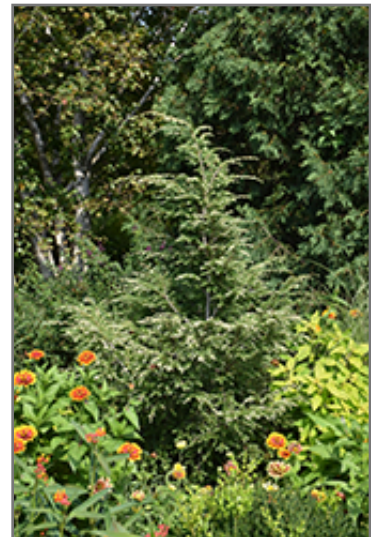
Gentsch White Hemlock