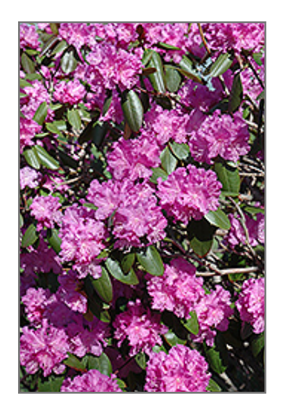
P.J.M. Rhododendron flowers