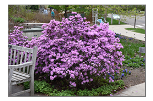
P.J.M. Rhododendron in bloom

P.J.M. Rhododendron is recommended for the following landscape applications;