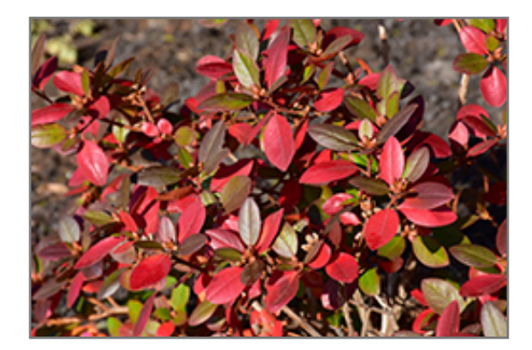
P.J.M. Rhododendron in fall

This shrub does best in full sun to partial shade. You may want to keep it away from hot, dry locations that receive direct afternoon sun or which get reflected sunlight, such as against the south side of a white wall. It requires an evenly moist well-drained soil for optimal growth, but will die in standing water. It is very fussy about its soil conditions and must have rich, acidic soils to ensure success, and is subject to chlorosis (yellowing) of the foliage in alkaline soils. It is somewhat tolerant of urban pollution, and will benefit from being planted in a relatively sheltered location. Consider applying a thick mulch around the root zone in winter to protect it in exposed locations or colder microclimates. This particular variety is an interspecific hybrid.