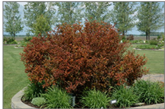
Coppertina Ninebark