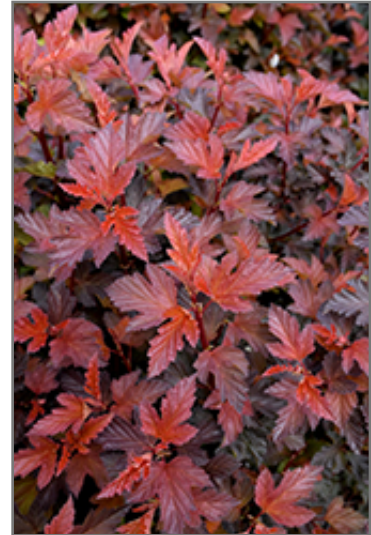
Coppertina Ninebark foliage

Coppertina Ninebark is recommended for the following landscape applications;