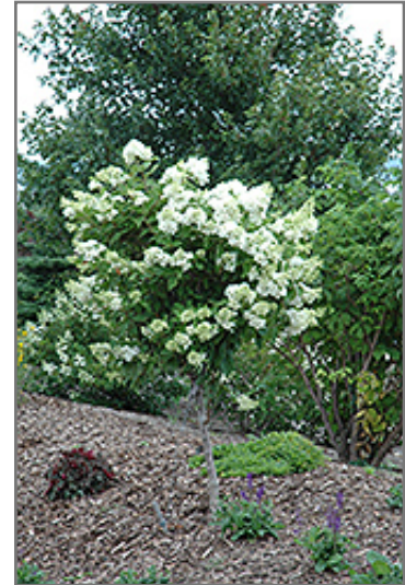
Pink Diamond Hydrangea (tree form) in bloom

Pink Diamond Hydrangea (tree form) will grow to be about 8 feet tall at maturity, with a spread of 6 feet. It tends to be a little leggy, with a typical clearance of 3 feet from the ground, and is suitable for planting under power lines. It grows at a medium rate, and under ideal conditions can be expected to live for 40 years or more.