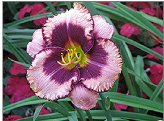
Daring Deception Daylily flowers