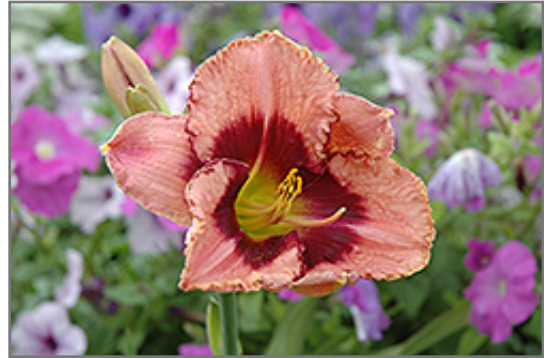
Daring Deception Daylily flowers

Daring Deception Daylily is recommended for the following landscape applications;