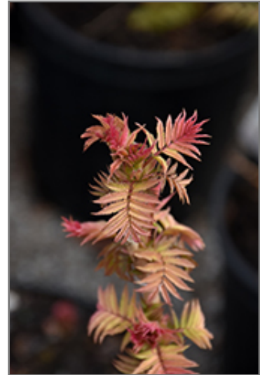
Cherry On Top False Spirea foliage

Cherry On Top False Spirea is recommended for the following landscape applications;