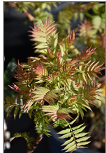
Cherry On Top False Spirea foliage