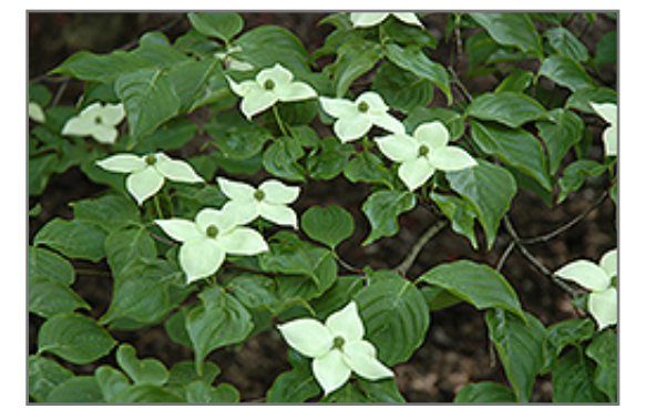
Blue Ray Chinese Dogwood flowers

Blue Ray Chinese Dogwood features showy bracted white flowers with chartreuse eyes held atop the branches from late spring to mid summer. It has attractive bluish-green foliage with hints of blue. The pointy leaves are highly ornamental and turn an outstanding burgundy in the fall. It features an abundance of magnificent crimson berries from early to mid fall. The peeling gray bark adds an interesting dimension to the landscape.