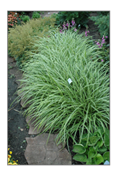
Ice Dance Sedge