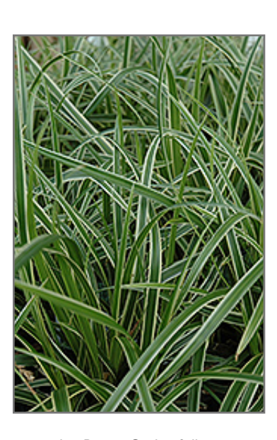
Ice Dance Sedge foliage