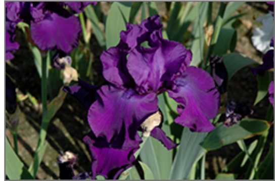
Titan's Glory Iris flowers