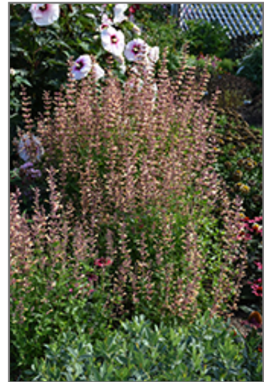
Meant To Bee Queen Nectarine Anise Hyssop in bloom

Meant To Bee Queen Nectarine Anise Hyssop is a fine choice for the garden, but it is also a good selection for planting in outdoor pots and containers. With its upright habit of growth, it is best suited for use as a 'thriller' in the 'spiller-thriller-filler' container combination; plant it near the center of the pot, surrounded by smaller plants and those that spill over the edges. It is even sizeable enough that it can be grown alone in a suitable container. Note that when growing plants in outdoor containers and baskets, they may require more frequent waterings than they would in the yard or garden.