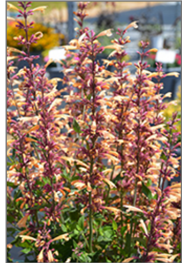
Meant To Bee Queen Nectarine Anise Hyssop flowers

Meant To Bee Queen Nectarine Anise Hyssop is recommended for the following landscape applications;