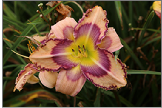
Handwriting On The Wall Daylily flowers