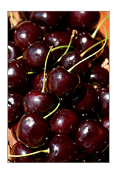
Lapins Cherry fruit

Lapins Cherry is draped in stunning clusters of fragrant white flowers hanging below the branches in early spring before the leaves. It has dark green deciduous foliage. The pointy leaves turn yellow in fall. The fruits are showy red drupes which fade to black over time, which are carried in abundance in early summer. The fruit can be messy if allowed to drop on the lawn or walkways, and may require occasional clean-up. The smooth dark red bark adds an interesting dimension to the landscape.