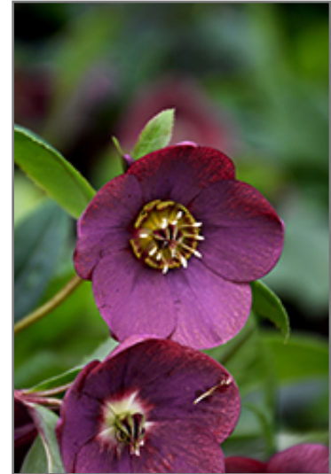
Honeymoon Rome In Red Hellebore flowers

Honeymoon Rome In Red Hellebore is recommended for the following landscape applications;