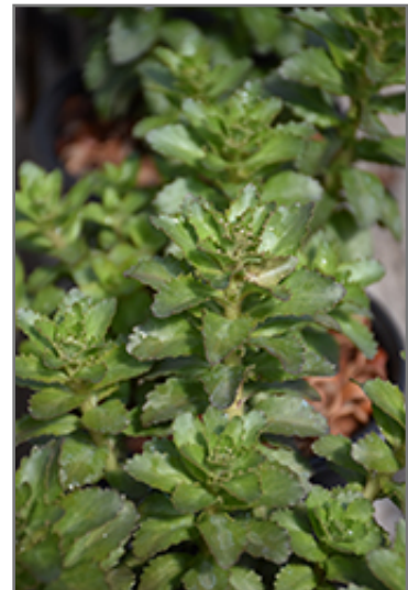
Double Martini Stonecrop foliage