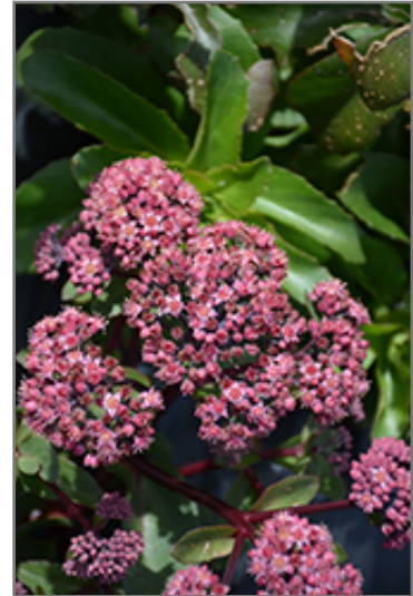
Double Martini Stonecrop flowers

Double Martini Stonecrop is a dense herbaceous perennial with an upright spreading habit of growth. Its relatively coarse texture can be used to stand it apart from other garden plants with finer foliage.