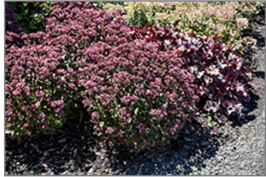
Double Martini Stonecrop in bloom