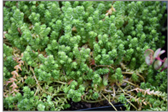
Oktoberfest Mossy Stonecrop foliage