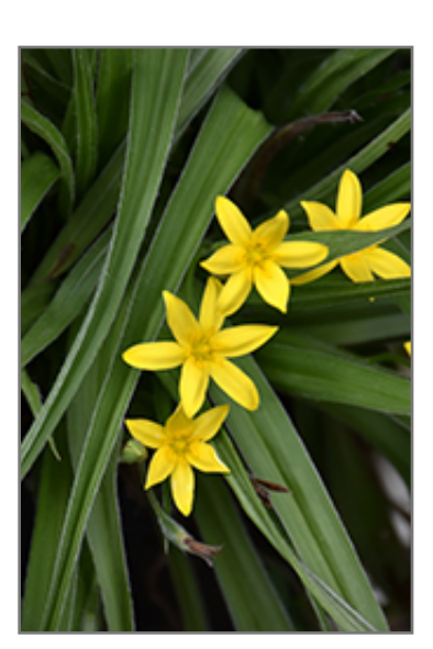
Common Goldstar flowers

This perennial wildflower presents a rosette of hairy, grassy leaves emerging from a small corm; yellow, star shaped blooms appear below the leaves in early to late spring and lasts a month; forms loose colonies, but not overly aggressive