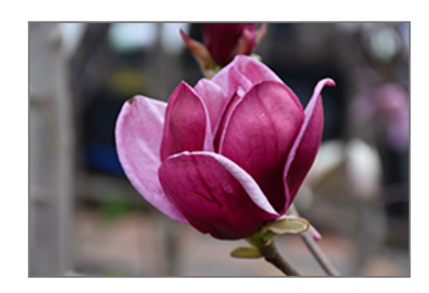
Genie Magnolia flowers