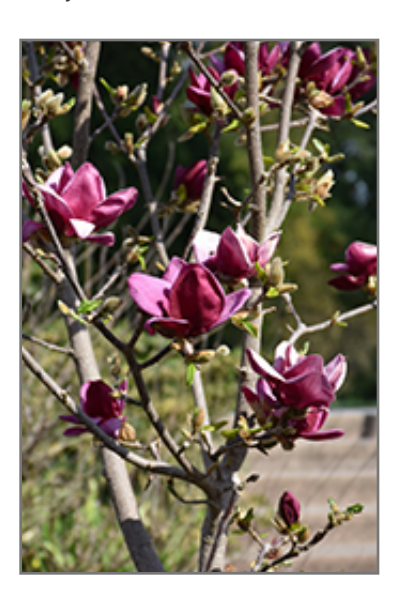
Genie Magnolia flowers