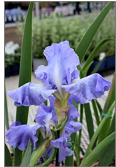
Victoria Falls Iris flowers