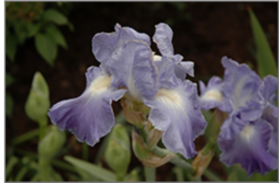
Victoria Falls Iris flowers

* This is a 'special order' plant - contact store for details