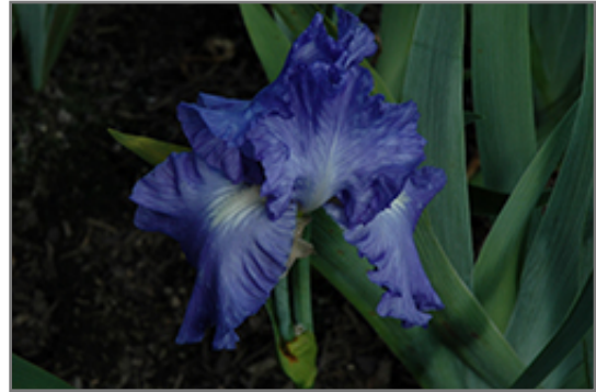
Victoria Falls Iris flowers

Victoria Falls Iris is an herbaceous perennial with an upright spreading habit of growth. Its medium texture blends into the garden, but can always be balanced by a couple of finer or coarser plants for an effective composition.