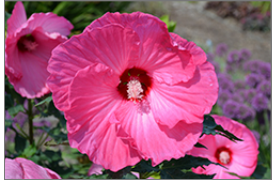
Airbrush Effect Hibiscus flowers

Airbrush Effect Hibiscus is recommended for the following landscape applications;