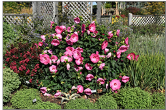
Airbrush Effect Hibiscus in bloom