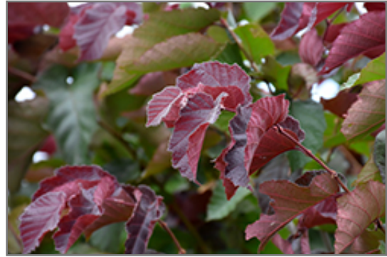
Purpleleaf Bailey Select American Hazelnut foliage