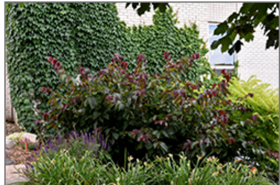
Purpleleaf Bailey Select American Hazelnut