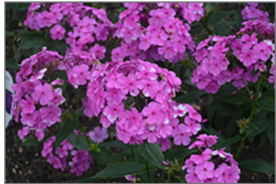
Cloudburst Phlox flowers