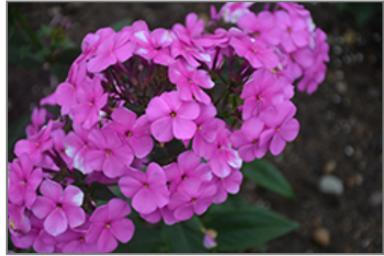
Cloudburst Phlox flowers

Cloudburst Phlox is recommended for the following landscape applications;