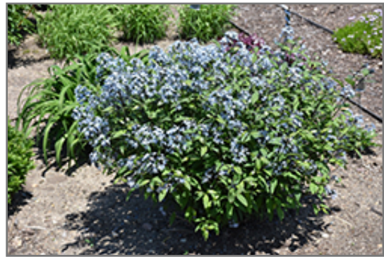
Storm Cloud Bluestar in bloom