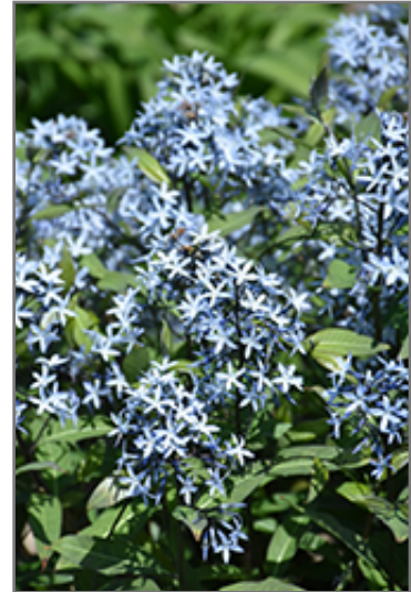
Storm Cloud Bluestar flowers

Storm Cloud Bluestar is recommended for the following landscape applications;