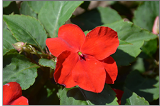
Accent Premium Red Impatiens flowers

Accent Premium Red Impatiens is recommended for the following landscape applications;