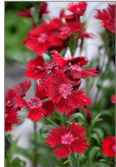
Rockin' Red Pinks flowers