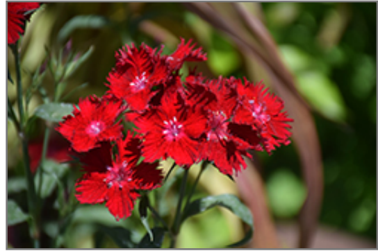
Rockin' Red Pinks flowers

This is a relatively low maintenance plant, and is best cleaned up in early spring before it resumes active growth for the season. It is a good choice for attracting bees and butterflies to your yard, but is not particularly attractive to deer who tend to leave it alone in favor of tastier treats. It has no significant negative characteristics.