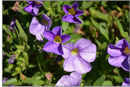
MiniFamous Neo Light Blue Calibrachoa flowers

MiniFamous Neo Light Blue Calibrachoa is recommended for the following landscape applications;