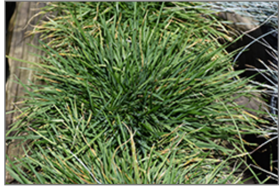
Pixie Fountain Tufted Hair Grass foliage

Pixie Fountain Tufted Hair Grass is recommended for the following landscape applications;