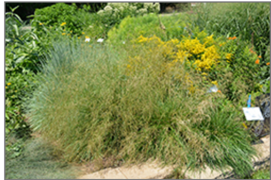
Pixie Fountain Tufted Hair Grass