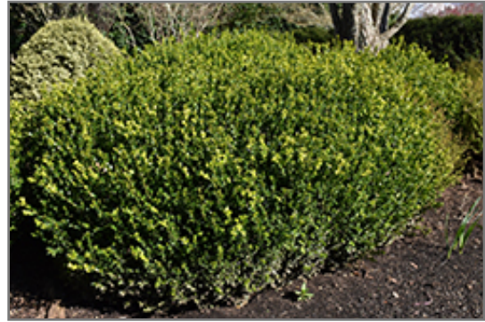
Green Beauty Boxwood