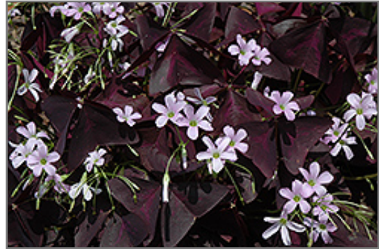
Purple Shamrock flowers

When grown indoors, Purple Shamrock can be expected to grow to be only 6 inches tall at maturity extending to 8 inches tall with the flowers, with a spread of 6 inches. It grows at a medium rate, and under ideal conditions can be expected to live for approximately 10 years. This houseplant will do well in a location that gets either direct or indirect sunlight, although it will usually require a more brightly-lit environment than what artificial indoor lighting alone can provide. It is very adaptable to both dry and moist soil, but will not tolerate any standing water. The surface of the soil shouldn't be allowed to dry out completely, and so you should expect to water this plant once and possibly even twice each week. Be aware that your particular watering schedule may vary depending on its location in the room, the pot size, plant size and other conditions; if in doubt, ask one of our experts in the store for advice. It is not particular as to soil type or pH; an average potting soil should work just fine.