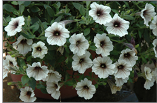
Supertunia Latte Petunia flowers