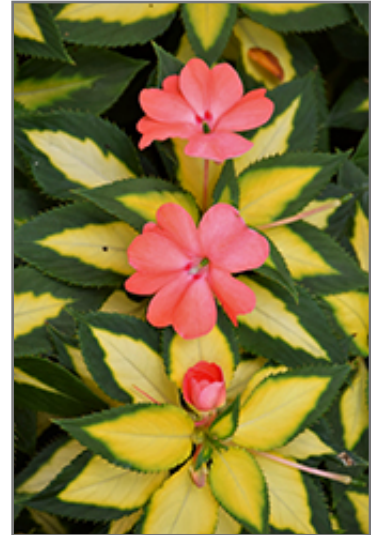
SunPatens Spreading Salmon New Guinea Impatiens flowers

This plant will require occasional maintenance and upkeep, and should not require much pruning, except when necessary, such as to remove dieback. It is a good choice for attracting bees and butterflies to your yard. It has no significant negative characteristics.